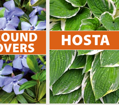
4' x 7' Mesh Banners