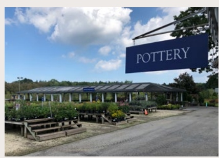
8" x 32" Correx Signs